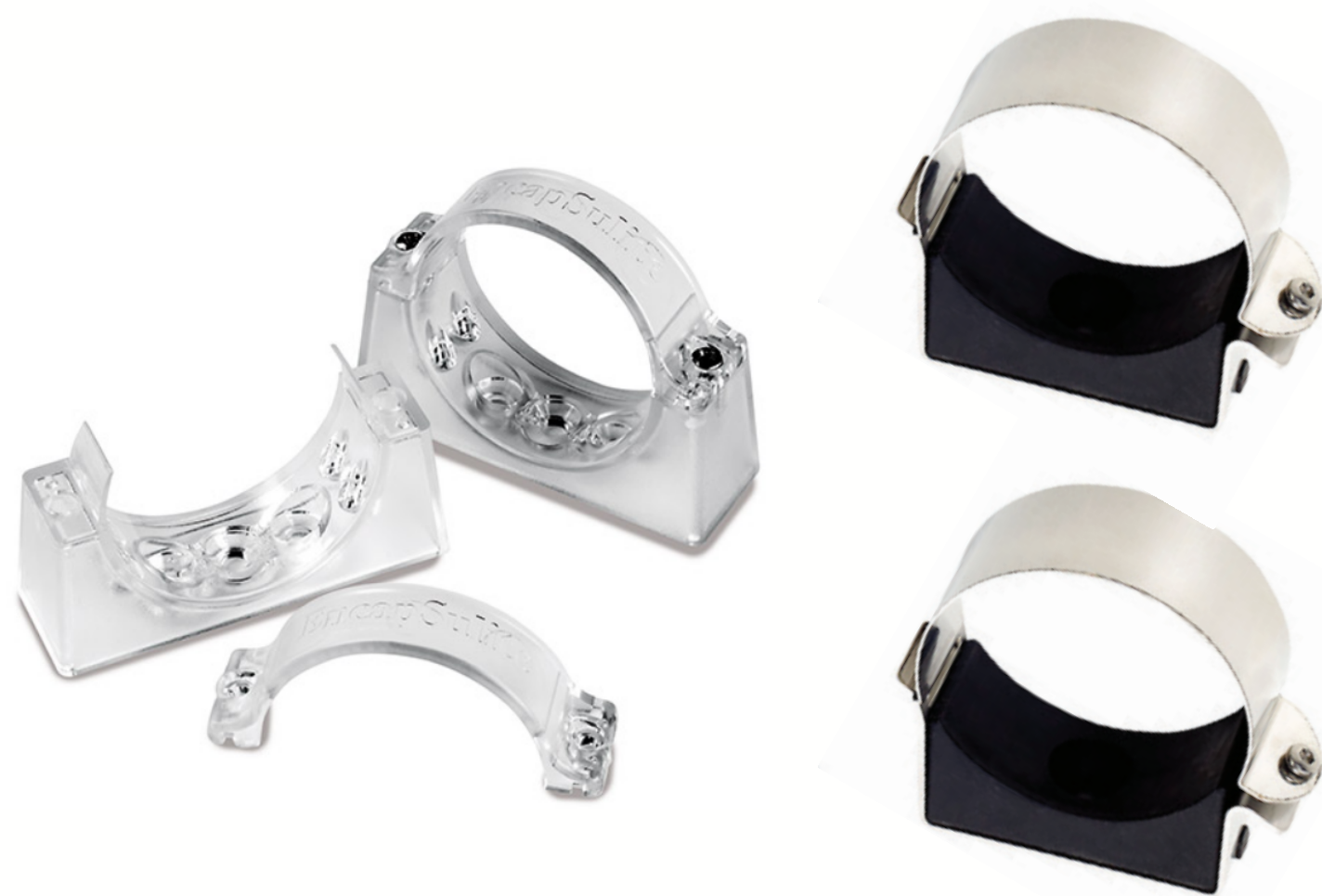
Mounting Brackets Plastic / Metal

IP Rating: IP20 Temperature Range: -20°C To +50°C Warranty: 3 Years